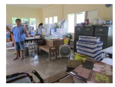
Temporary site of the Pilar Municipal Health Office, one undivided 10x15m room