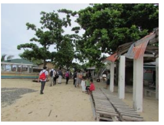
Travel to Pilar, the most remote municipality in Camotes, by 25 minute boat trip from Poro island (left). Arriving in Pilar (right).

The first stop on our tour of Pilar was a mass immunization event organized by the Provincial Department of Health.